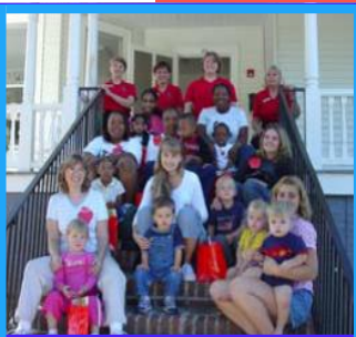
Parent Resource Center 22 Nimmons Street

The Puddle Jumper program is a “mommy and me” program designed for two and three year olds. The program is a partnership between the Stepping Stones Early Intervention project and the Coweta County School System Title 1 program. The goal of the program is to teach moms and dads skills that will help them learn to interact more effectively with their preschoolers. These skills will help their preschooler be better prepared for the early years of learning.